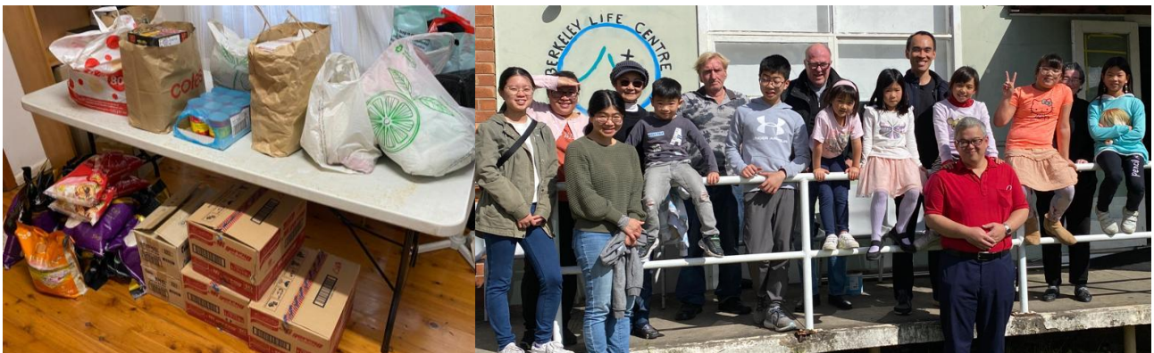
Donations for Berkeley

Some of us visited Berkeley to knock on people's doors, give out food to the needy and help out in the Op Shop. We had a few gospel conversations. One of the conversations we had was with a family. They visited Berkeley Church a few years ago but have stopped coming ever since their daughter was born. After our conversation, they said thanks for the food and that they'll go to church again. We also had a chat with a lady from a Macedonian background. We got to talk about God and she said that we are doing a good work. We'll be organising a visit to Berkeley again on 23 Sep and 18 Nov.