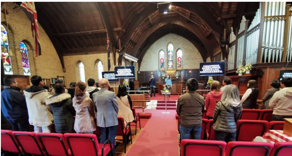
The first service of the 4pm Mandarin congregation

The Mandarin service from AAC, has joined with some St Georges Hurstville members to start a new 4pm Mandarin service at SGH. People are getting to know one another and beginning to invite friends and family.